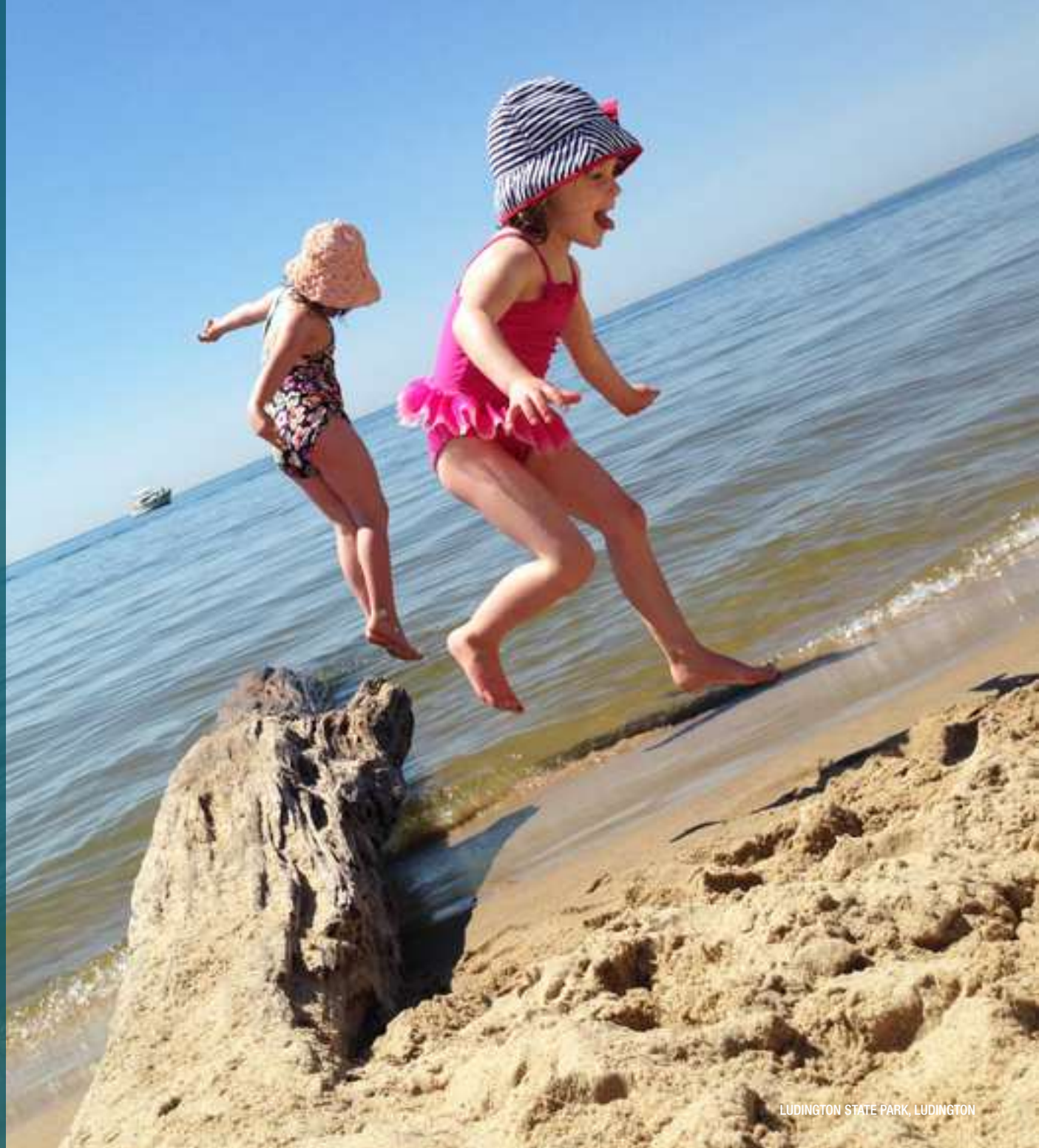
LUDINGTON STATE PARK, LUDINGTON

THE LIFETIME AVERAGE SCORE is a composite average of the legislator's final scores throughout their terms in office.