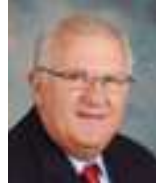
Senator Dale Zorn R—IDA

This bipartisan group of legislators not only worked together to fend off attacks on Michigan’s renewable energy and energy efficiency standards, but they also went to the mat to ensure that we were able to actually increase Michigan’s commitment to developing clean, renewable energy. They pushed behind the scenes, lobbied their colleagues,