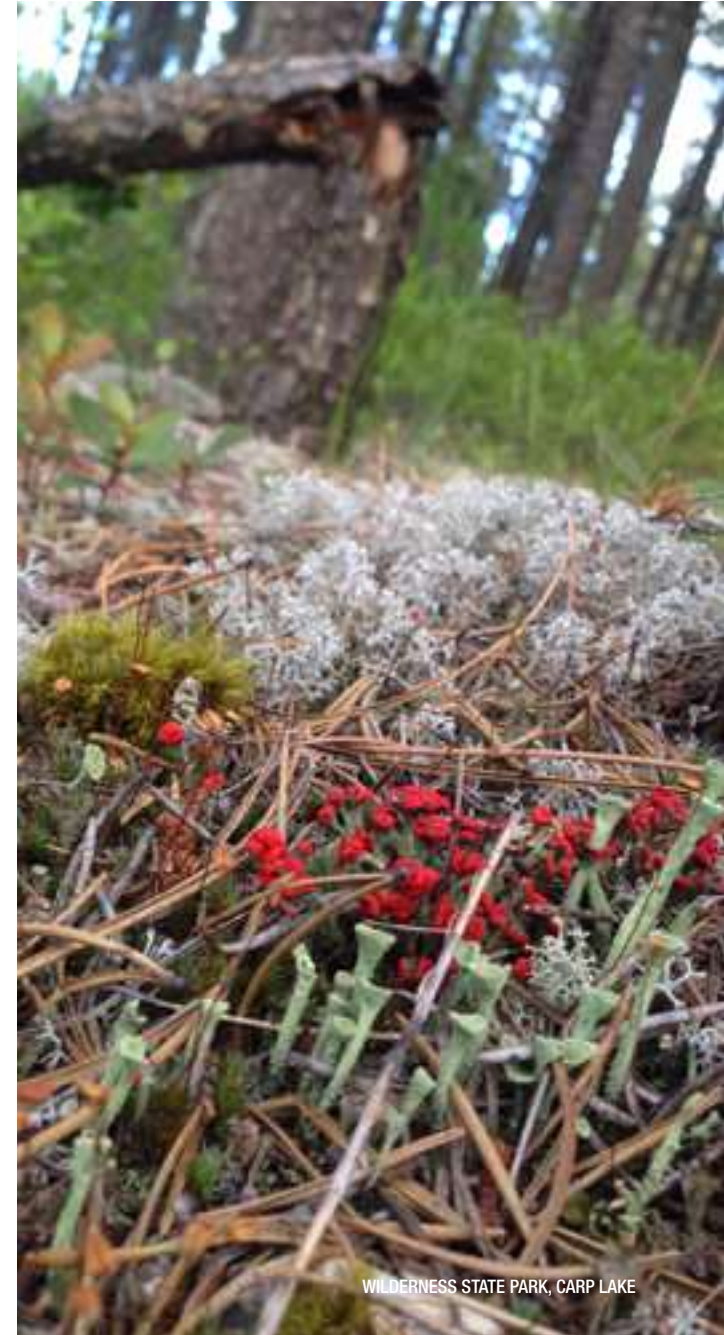
WILDERNESS STATE PARK, CARP LAKE

Passed the House; referred to Senate Government Operations Committee. Stalled in the Senate.