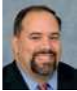
Senator Jim Ananich D—FLINT