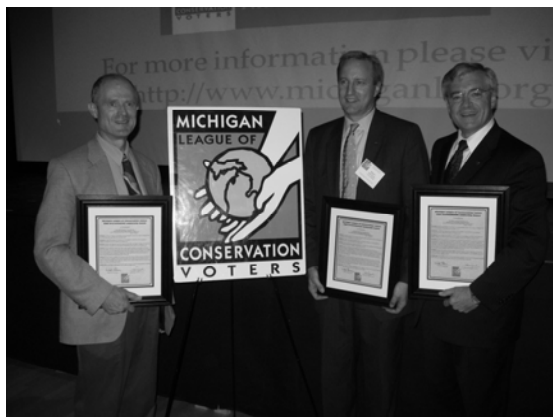
Above: The three honorees—Mayor Hieftje, Mayor Sisson and Mayor Heartwell