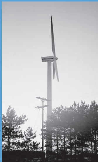
One of Michigan's three wind turbines generates power in Leelanau County.

+ You can also contact your representative directly, either by calling them in Lansing or, preferably, setting up a meeting in your home district. Again, Michigan LCV would be happy to help with the meeting or even attend if you would like.